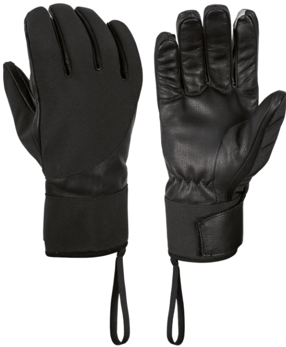
INES Short Black

Lightweight, sensitive softshell gloves for colder environments that can be worn all day, with wind and moisture protection, designed for military and police use.