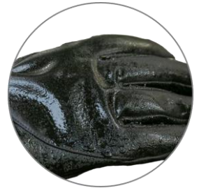
Wind and water resistance