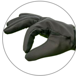
Flexibility and breathability