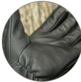
Goatskin leather with hydrophobic treatment