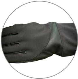
Softshell - 3-layer laminate