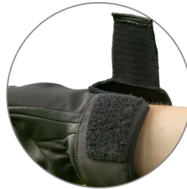
Glove is finished with a Velcro closure strap